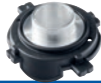
Template guide Ø 24 mm Order No. 209850