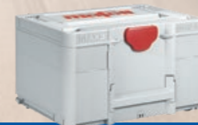
MAFELL MAX 3