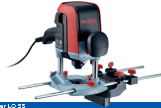
Hand router LO 55