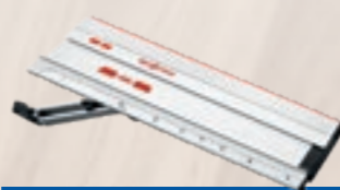
Angle fence F-WA Order No. 205357