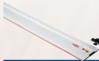
Guide rail LR Designation Length Order No. F 80-LR 0.80 m 207600 F 160-LR 1.60 m 207601