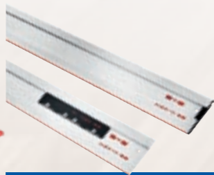
Guide rail F Designation Length Order No. F 80 0.80 m 204380 F 110 1.10 m 204381 F 160 1.60 m 204365 F 210 2.10 m 204382 F 310 3.10 m 204383