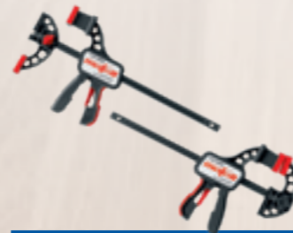
Lever clamp F-SZ 180MM 2 clamps, for fixing guide rail to workpiece Order No. 207770