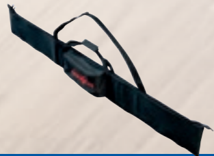
Guide pocket Guide pocket F 160 for guide rails up to 1.6 m long Order No. 204626