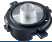
Template guide Ø 17 mm Order No. 209851