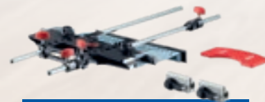
Adapter for hand router LO-FA Order No. 207200