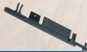
End caps F-EK 2 caps Order No. 205400