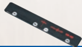
Connecting piece F-VS for joining two guide rails Order No. 204363