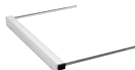
Parallel guide fence K55-PA