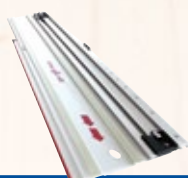
Guide track 770

Max. cutting length 770 mm Ref. No. 204378