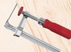
Screw clamp F-SZ 100MM

2 clamps, for fixing track to work Ref. No. 205399