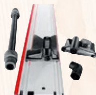
Suction clamping system

Guide rail set with bag: F80 + F160 + F-WA + F-VS + 2 x F-SZ 100MM + guide pocket Ref. No. 204749