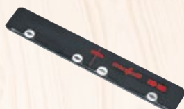
Connecting piece F-VS

Max. cutting length 770 mm Ref. No. 204378