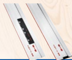
Guide rail F

For joining two guide tracks Ref. No. 204363