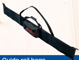
Guide rail bags

Guide Bag F 160 for guide rails up to 1.6 m l Ref. No. 204626