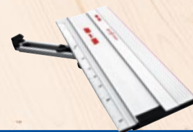
Angle fence F-WA