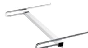
Roller edge guide