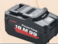
Battery PowerTank 18 M 99

APS 18 M, 18V High-speed charger APS 18 M+ Ref. No. 094453 Ref. No. 094439