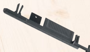
End cap F-EK

Flexible hose FXS L Length up to 3.2 m Ref. No. 205276